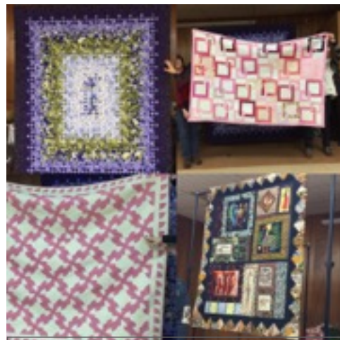
A selection of the quilts shown at last meeting