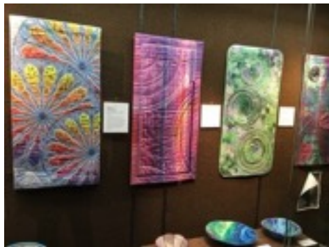
Fiber Arts Show at Seaside City Hall. Now thru January 28th.