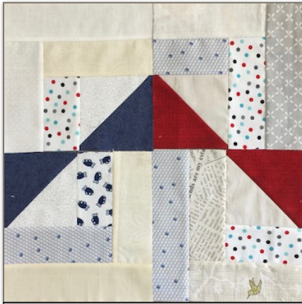
Picture above shows Four blocks

July brings Red, White & Blue to my mind. I was just introduced to this block through a Bee that I belong to. I resized the block to start with an easily available 5" squares. These instructions will make two blocks. Hope you will join the fun. Block Source .