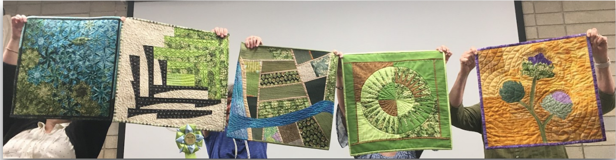
We Heart Artichokes - Member Quilts from Artichoke Fair